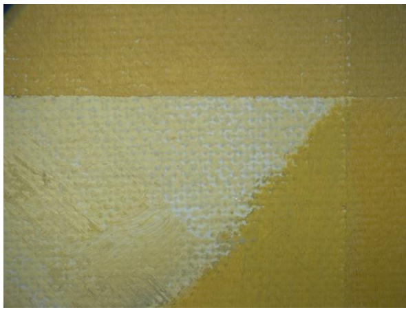
Macrograph showing white ground visible through the upper paint layer in the wings