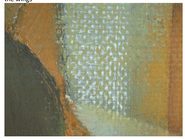
Macrograph showing rubbing back or abrasion in the bird's