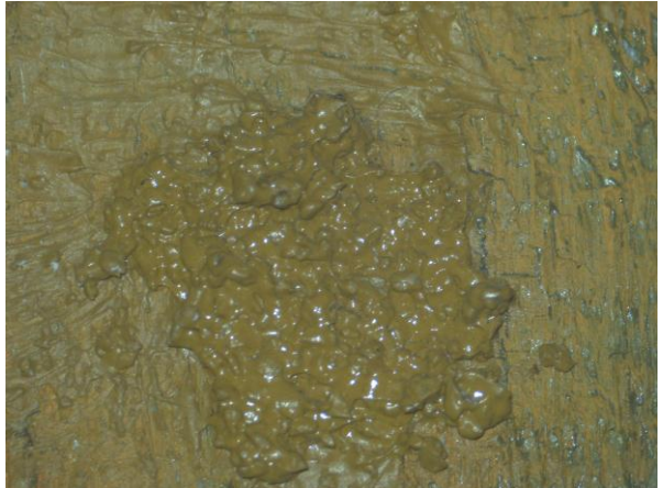
Detail in raking light showing the texture achieved with the inclusion of sand in the paint