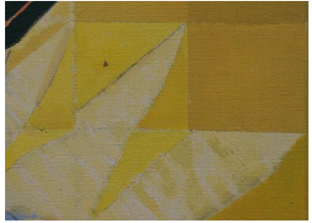
Detail showing the reserves of the white ground visible at the wings

granules is another interesting feature apparent in the lower left of the painting, which produces an interesting texture to the surface of the paint.