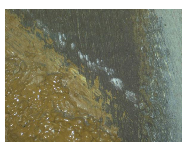
Macrograph showing drawing in chalk at bottom of leg, left, over the paint layer