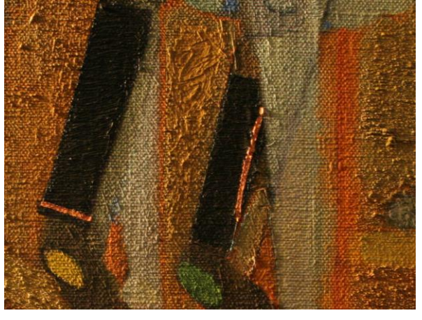
Raking light detail showing variety of brushstokes in the legs as well as stencil for the stripe