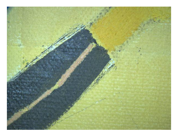
Macrograph showing drawing in pencil at pentiment below arm applied over the background paint, as well as evidence of underdrawing at hand, and a further pentiment at the cuff with adjustments via sgraffito

"Essentially the flat background does the footwork in my paintings; it is usually a base colour, or colours, and it sets the mood. Whether a painting contains minimal information or has very complicated imagery, in each case it is with the background that it all begins. It is my first concern, long before I start with the detail. The components of the imagery then assert themselves on the flat space in terms of their shape, line and colour." (Michael Stevenson, Stanley Pinker , 2004:19)