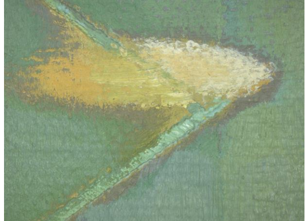
Macrographs showing use of masking by a stencil or ruler for the straight lines in the paint application